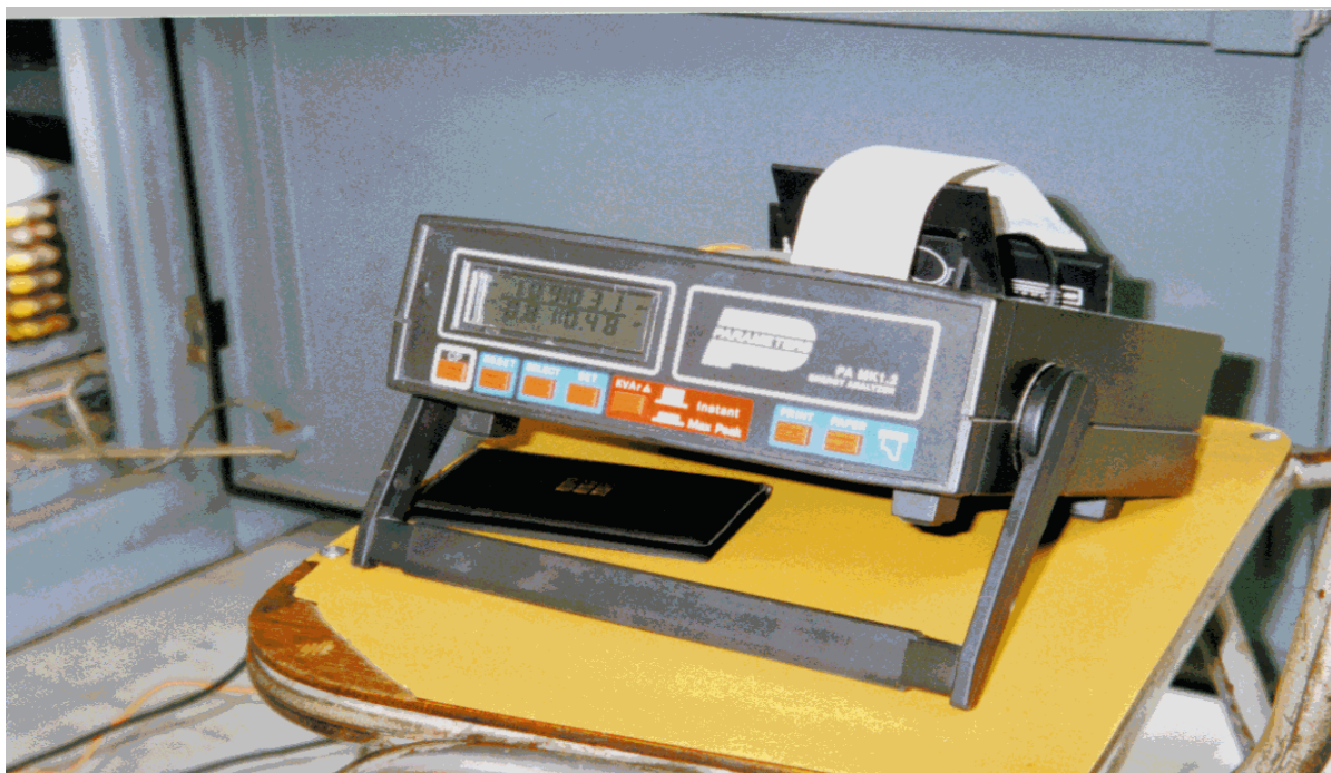
Photograph No. 2 – Microvip Energy Analyser connected to the rear of the switchboard