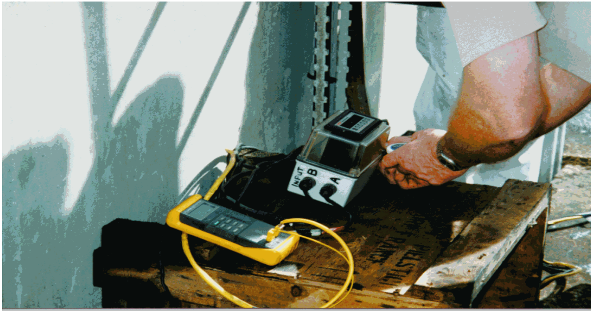
Photograph No.1 – KEF rate meter and Fluke digital thermometer at the fuel measurement Recording station